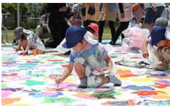
Children in a kindergarten painting a mural for Kids' Guernika in Hiroshima, 2015