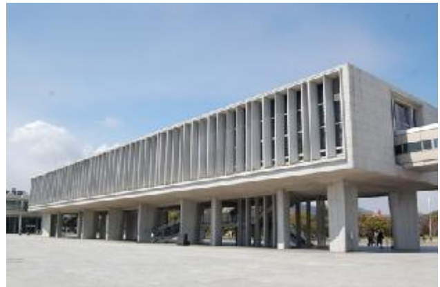
Hiroshima Peace Memorial Museum

finish a day before the INMP conference so that the young participants could also attend the conference. The author would be happy to join an INMP working party to develop this project. If interested, please make contact at this email address .