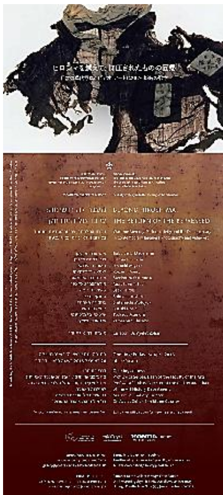
Art Exhibition “Beyond Hiroshima”

exhibition on the Holocaust, presented in a contemporary way by third generation Jewish artists, can be arranged in Japan. I hope that the reviews and impressions that will reach Israel will reflect the great importance of such an exhibition to the young generation. Perhaps by doing so, the feedback will prepare the ground for creating such an exhibition in Israel.