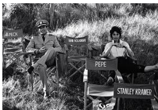
From the making of the film 'On the Beach'